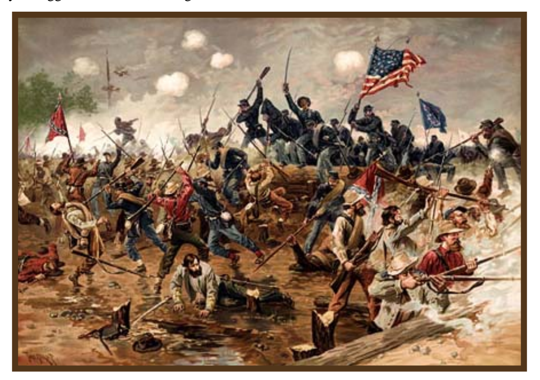
Page 1 of 1