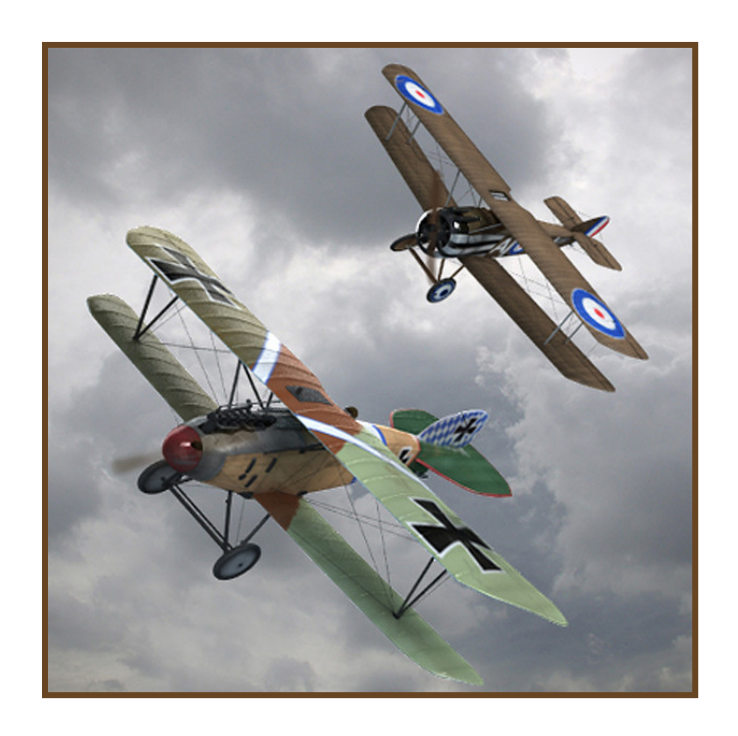
Page 2 of 2

Franklinville in World War I, Part II, will continue next month, Jan 2021.